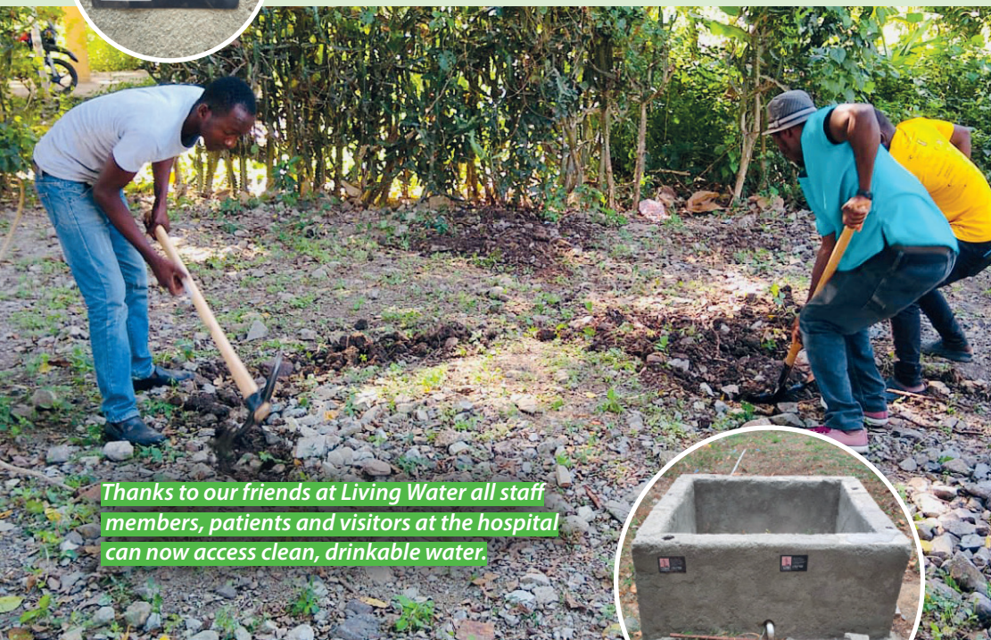
Thanks to our friends at Living Water all staff members, patients and visitors at the hospital can now access clean, drinkable water.